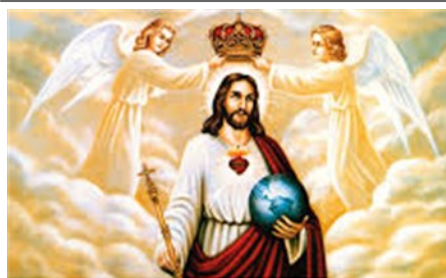
Our Lord Jesus Christ, King of the Universe