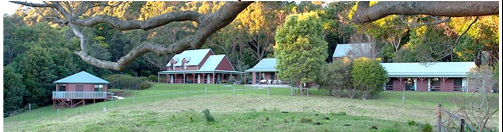
Some of the monastery buildings