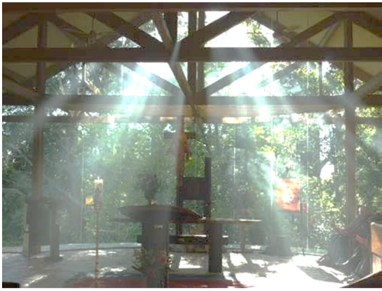
The Sanctuary of the Abbey Church

In the second installment of this mini-series on the monasteries which have recently joined the English Benedictine Congregation, we hear from the nuns of Jamberoo Abbey, New South Wales, Australia: