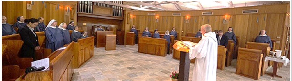
The Community in their choir stalls